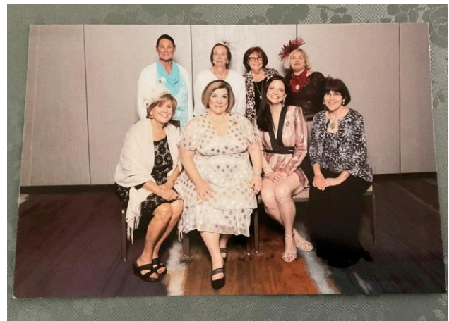
GFWC RI Clubwomen at the 2023 GFWC Convention

GFWC New England Region Conference will be held this year in Connecticut. September 22-24, 2023. It will be a great time to join fellow GFWC club women from all over New England. It would be nice to have a nice number of RI women in attendance. All club presidents have received the information and will disseminate.