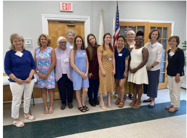
Pictured above are five of the eight scholarship recipients and the Scholarship Committee.

June meeting. Some of the past scholarship recipients have gone on to become valued members of GFWC WCSC.